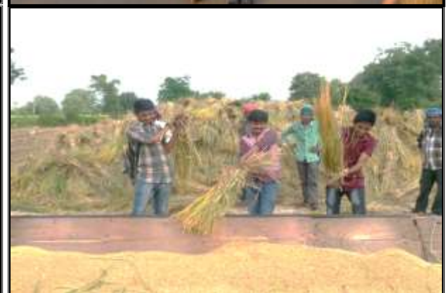
Activities conducted under RAWE Programme by students of seventh semester