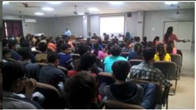
Orientation was organized for students of Seventh Semester under RAWE Programme